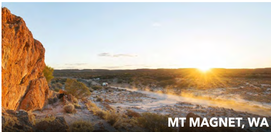
MT MAGNET, WA

Mount Magnet is one of the Mid West region's original gold mining towns and the longest surviving gold mining settlement in Western Australia. It is home to the famous Hill 50 GM - Australia's deepest and for a time, richest, underground gold mine.