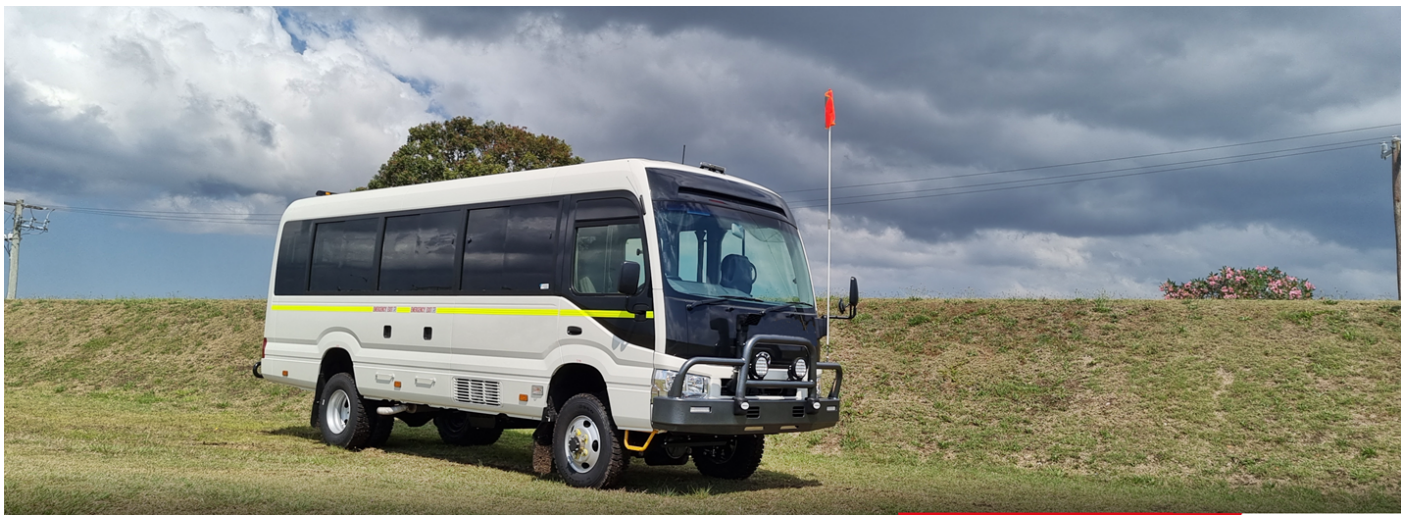
Pictured: Bus 4x4 Conversion of Mine Spec Toyota Coaster