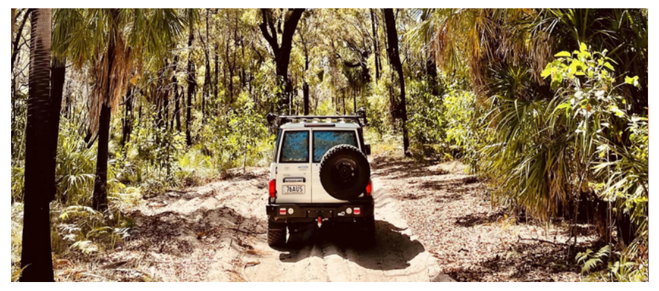
Deepwater National Park